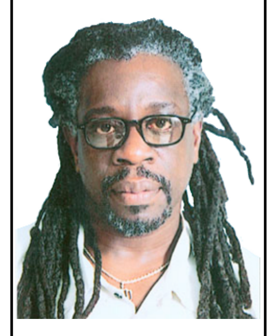
Black Liberation Army and People's Warrior