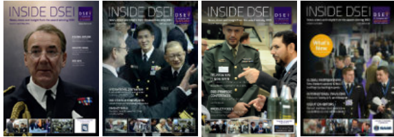
Download INSIDE DSEI, April/May 2014