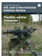
IHS Jane's International Defence Review