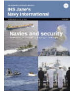
IHS Jane's Navy International