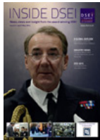
Download INSIDE DSEI, April/May 2014