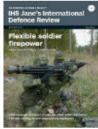
IHS Jane's International Defence Review