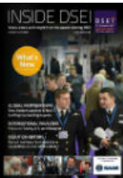
Download INSIDE DSEI, June 2015