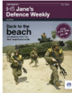
IHS Jane's Defence Weekly