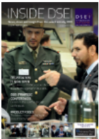
Download INSIDE DSEI, February 2015