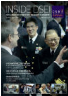
Download INSIDE DSEI, October 2014