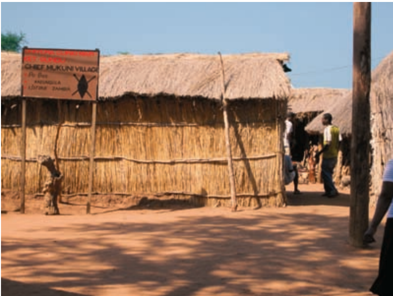
4 Chiyema Curio Market, Gundu. Chief Mukuni Village, near Livingstone, Zambia.