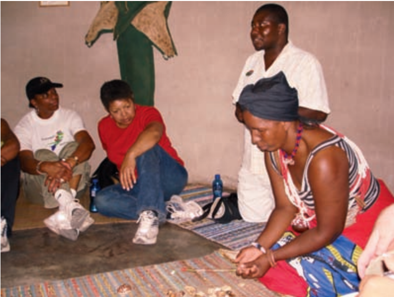
5d Mafunya Cultural Village, Limpopo, South Africa: (iv) "traditional" healer, in translation, performs a divination for African-American tourists, September 2007.