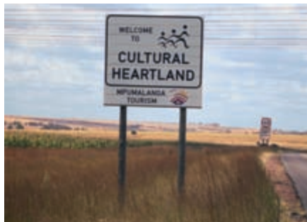
8 "Welcome to Cultural Heartland: Mpumalanga Tourism." Mpumalanga Province, South Africa.