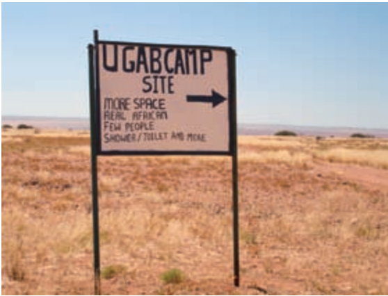
9 "More Space, Real African." Central Namibia, 2007.