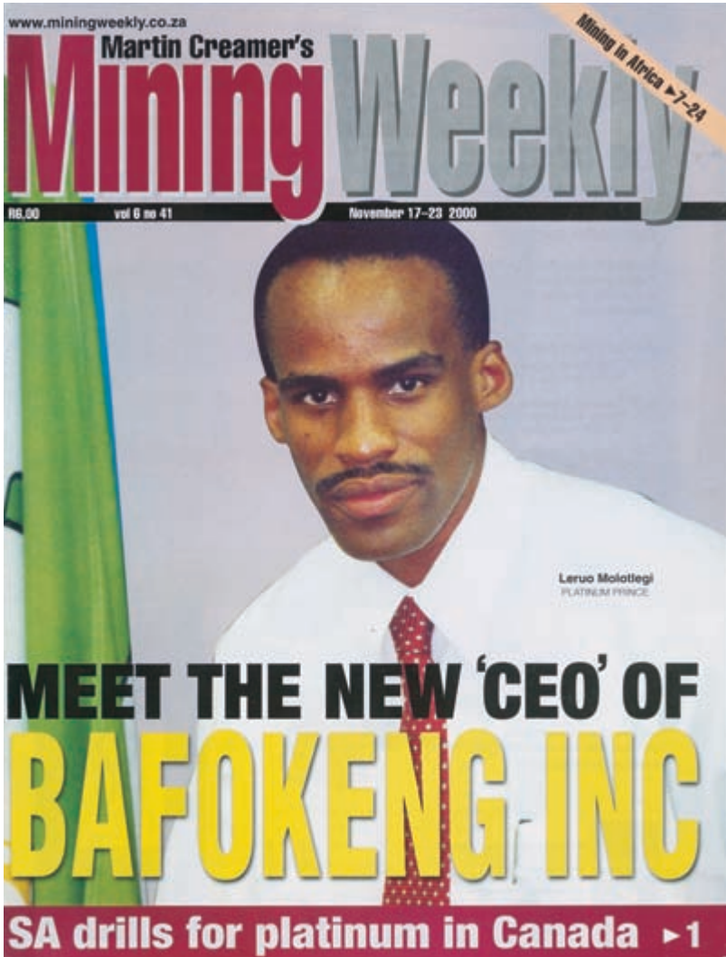
2 "Platinum Prince: Meet the New 'CEO' of Bafokeng Inc.," Creamer Media's Mining Weekly, 2000.