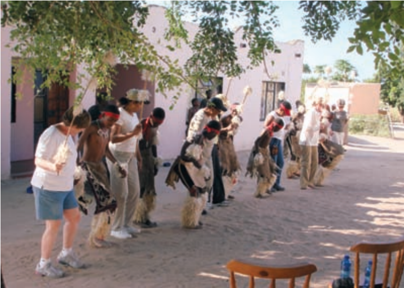
5c Mafunya Cultural Village, Limpopo, South Africa: (iii) learning the dance: American tourists performing their otherness.