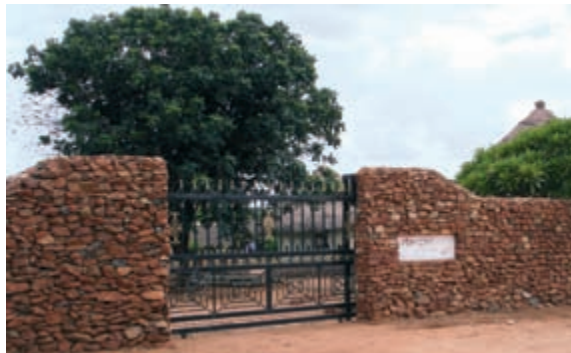
7 Makuleke Cultural Village, Limpopo, South Africa.