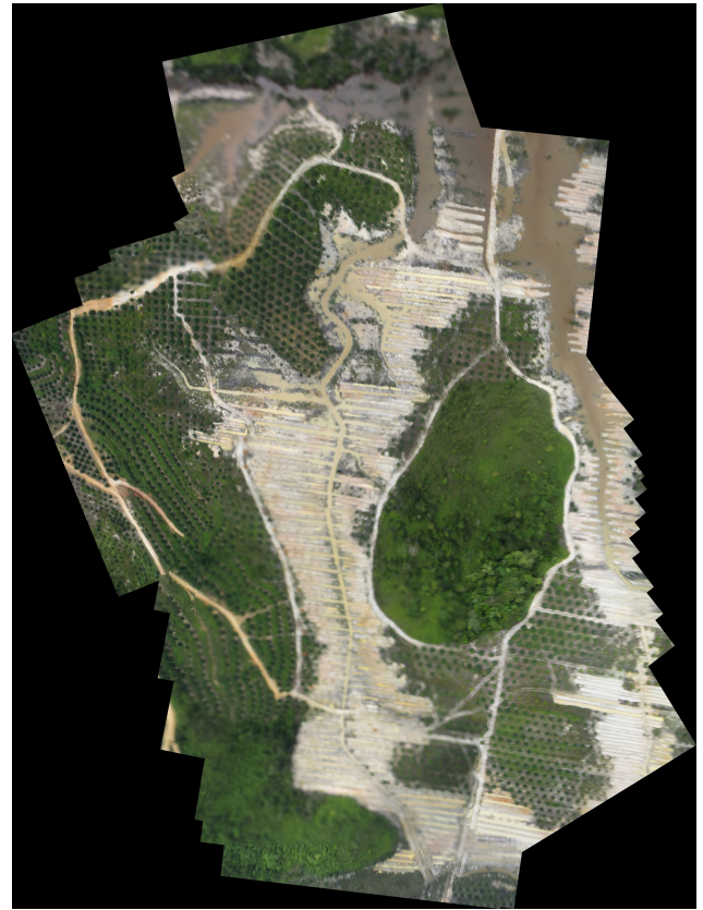
Figure 4. Drone-produced orthophoto showing the drained swamp forest lake Danau Meradung and the enclaved cemetery forest.

The second area was about 30 ha and previously a wetland swamp (Danau Meradung) and a customary cemetery forest (Fig. 4). The area was drained and turned into an oil palm plantations. The company also left part of the cemetery forest as an enclave inside the plantation. Several influential community members gave permission to clear the land without consulting the others, leading to dissatisfaction within the wider community. CRG members and other locals accompanied us to the area and thought that a drone map would be beneficial for their struggle in the future. The orthophotograph shows the extent of the draining canals in the centre,