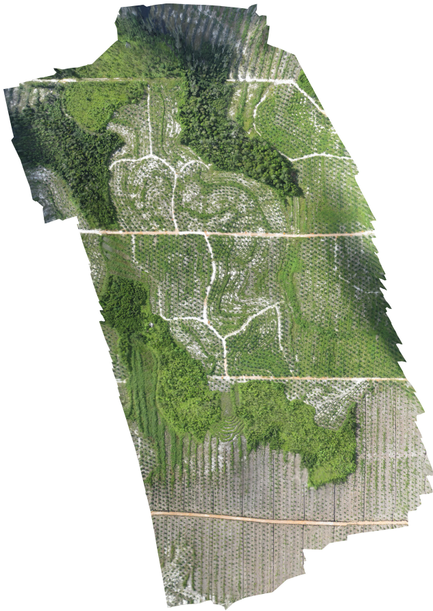
Figure 3. Drone-produced orthophoto showing palm oil planted on local farmland, rubber gardens and customary forest.

recently planted with oil palm and enclaves left out of the conversion. The land south of the horizontal transect road is claimed by the family, while the land north of the road was customary forest released to the company by the customary council leaders. In the northwestern corner, a site was being prepared for a palm oil factory that has recently been opened by the head of the district. The photo is actually a high-resolution and georeferenced orthophoto which can be zoomed into for more detail. The CRG hopes that it can be used to claim back the land or to obtain reasonable compensation.