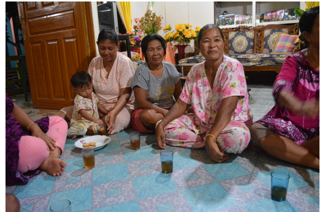
Figure 1. A group discussion with the women’s group in Tayan.