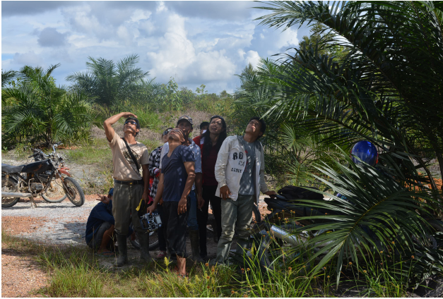
Figure 5. Flying the drone with the citizen research group in Ketungau Hilir.

tographs and discuss the map directly, and thus a key empowering moment of the drone technology was lost.