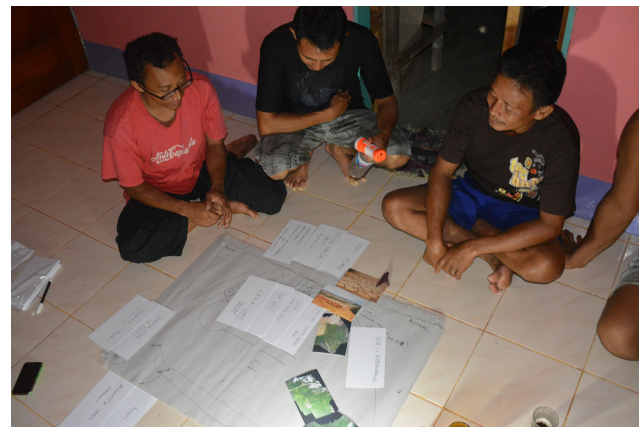
Figure 2. Spatial problem and intervention analysis. Key issues and interventions identified by the citizen research group were related spatially to the river.

and Ahmed, 2007). We continued with a series of “place biography narratives” exploring the history and changes to the place and the river and with a “river transect,” i.e. a trip by boat up and down the river to identify key issues, problems and changes. The heart of the PHPA consisted of a series of group discussions, i.e. the “spatial problem analysis”, “change objectives” and the “spatial intervention analysis” (Fig. 1). The idea was to discuss perceived problem and key actors (affected by and responsible for) and to locate these in sketches where the village or place of the PHPA was related via the river to other nodes of relevance (Fig. 2). The line of enquiry was then determined by key change objectives identified by different groups (women-only group, youth group, men’s group, etc.) and by potential interventions that could be followed up by the community itself.