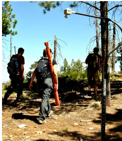
Figure 7: Long-term science monitoring infrastructure and instrumentation on Mt. Bigelow (Day 2)