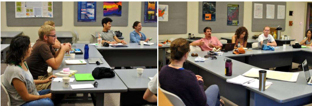
Figure 1: Graduate and undergraduate student participants of the Public Political Ecology Field Course

The Public Political Ecology Field Course project consisted of an intensive two-day course held on Saturday, June 2 nd and Sunday, June 3 rd , 2013 at the University of Arizona campus in Tucson, Arizona and on Mt. Bigelow in the Coronado National Forest. Our approach of combining critical pedagogy, field-based experience, and political ecology’s diverse theoretical and methodological toolkit attracted an interdisciplinary group of undergraduate students – with majors ranging from anthropology and geography, to geophysics and natural resource sciences. Grant support allowed us to provide the weekend learning experience at no cost to students; grant funds covered classroom and vehicle rental, breakfast, coffee and snacks, and a small stipend for the graduate students involved.