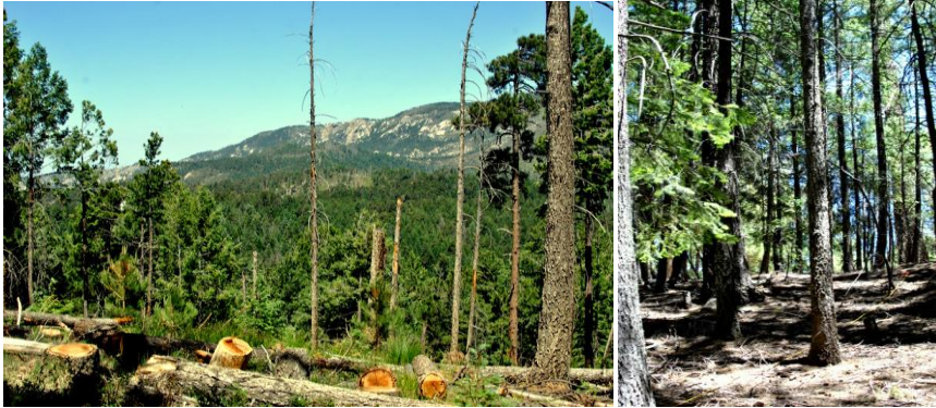
Figure 2: Mt. Bigelow field sites (Left image: Highly managed forest site; Right Image: 'Pristine' old growth forest site)

unique, high elevation forest within the larger Sonoran desert landscape, and has been (and continues to be) the site of numerous scientific investigations.