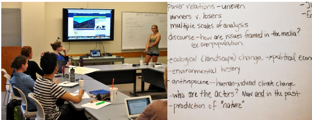
Figure 3: Discussion of pre-course readings and student-led white boarding of political ecology concepts (Day 1)

the pre-course readings, participants were also encouraged to share relevant insights from their own previous life experiences. Crucial points of discussion and debate swirled among the themes of uneven power relations, experts and expertise, dominant discourses, exclusion and dispossession, and social justice. Drawing on the diverse backgrounds of the graduate students in forest ecology, hydrology, and fire science, and our stated commitment to maintain a balanced focus on ecology and politics, we consciously worked to tie insights from social theory to transformations in the biophysical environment. However, not unlike Walker's warning, we found maintaining a serious and ongoing engagement between social theory and ecological theory challenging.