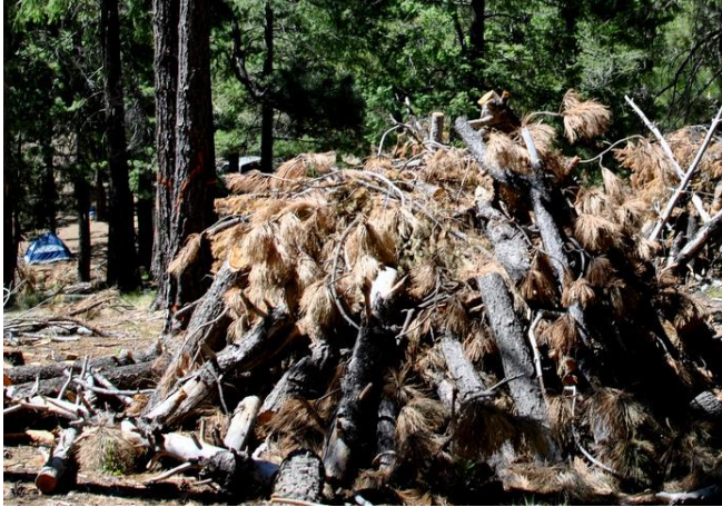
Figure 6: The foreground of this image shows debris from forest management practices, while in the background a blue tent of a recreational camper is visible (Day 2)