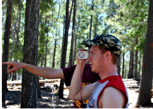
Figure 9: (6 photos above) Students learn conifer identification techniques and practice Rapid Ecological Assessment methods to study and compare the ecological conditions of the two forest sites – thinned and unthinned (Day 2)