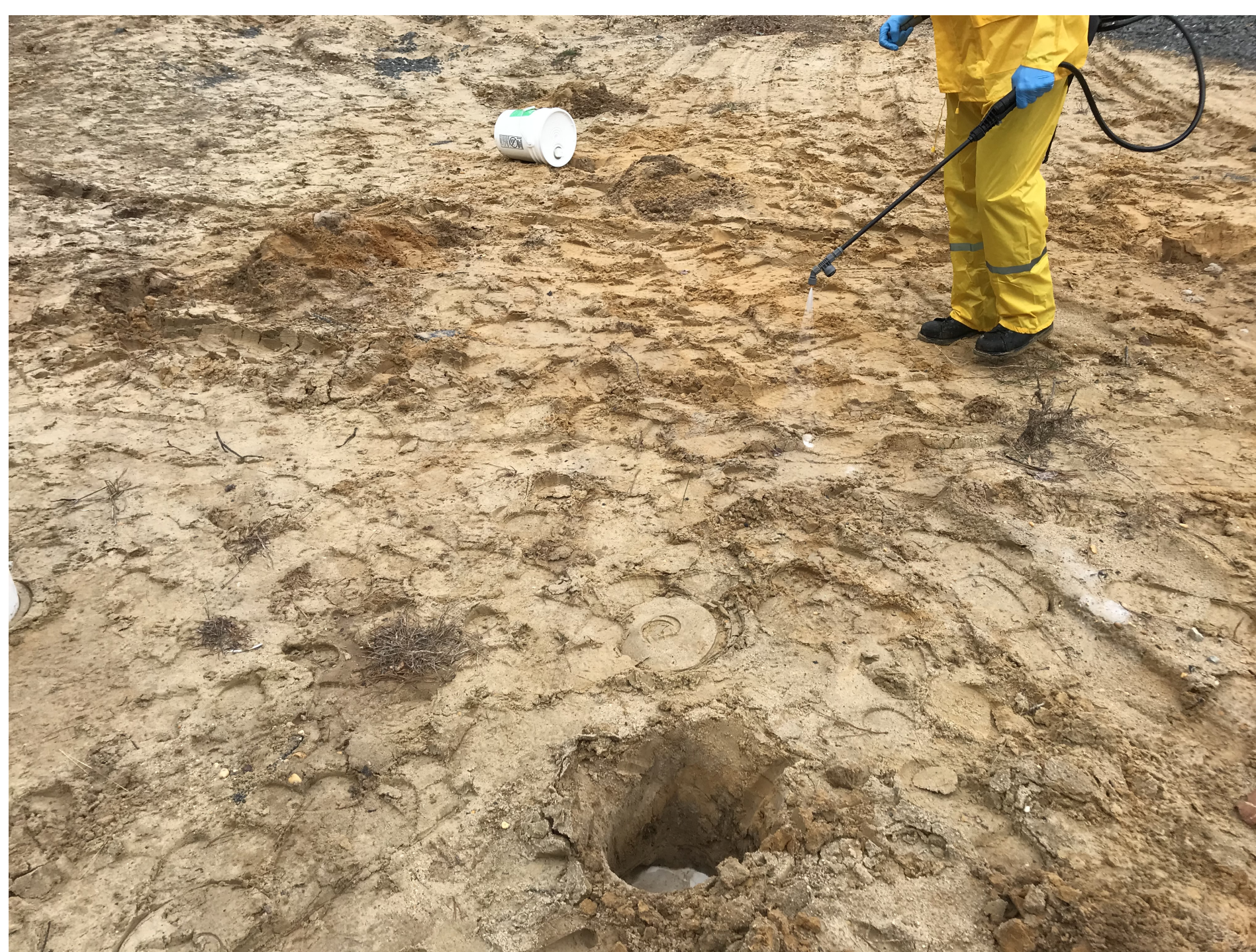
Remediation of groundwater with HydroRemed